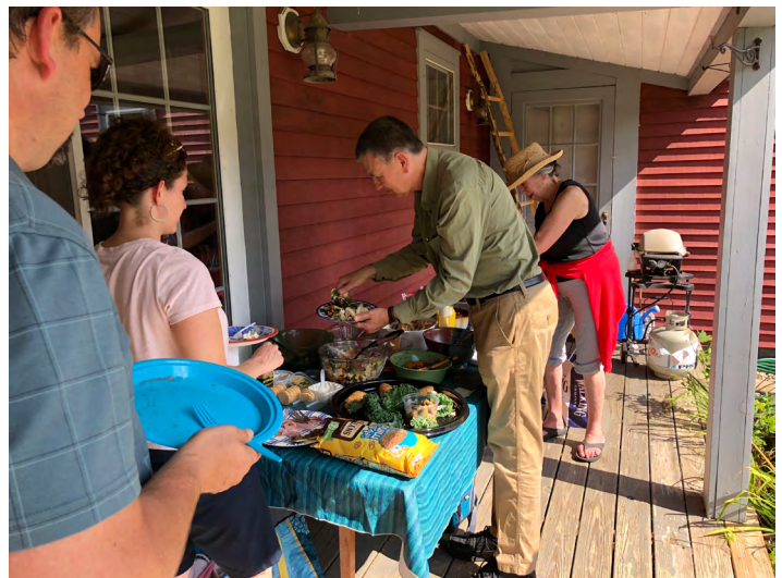
Plenty of delicious food at our picnic