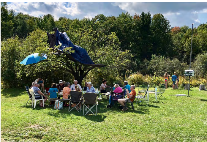
Enjoying the MUUF family picnic on Sept. 16