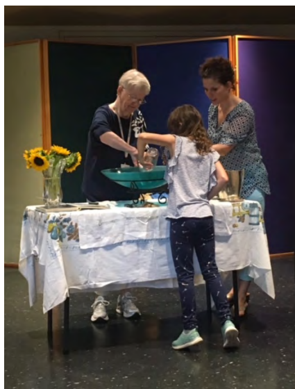
The Water Communion service on Sept. 16 with participation by both adult members and children

This community service is a nice way to get to know folks outside the Fellowship as well as connect with our own members while doing service work. We look forward to seeing you on October 24th!