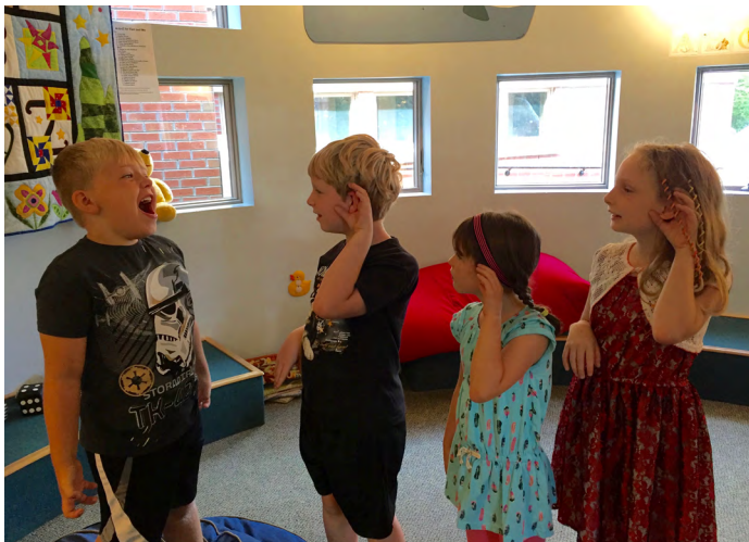
Role playing our Religious Exploration covenant

Any child ages 9-13, is invited to attend the annual Mid-Maine Pre-Teen Conference. This year, the conference will be held at the newly renovated UU Church in Belfast on November 18-19.