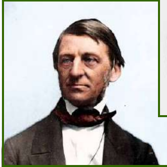
Ralph Waldo Emerson