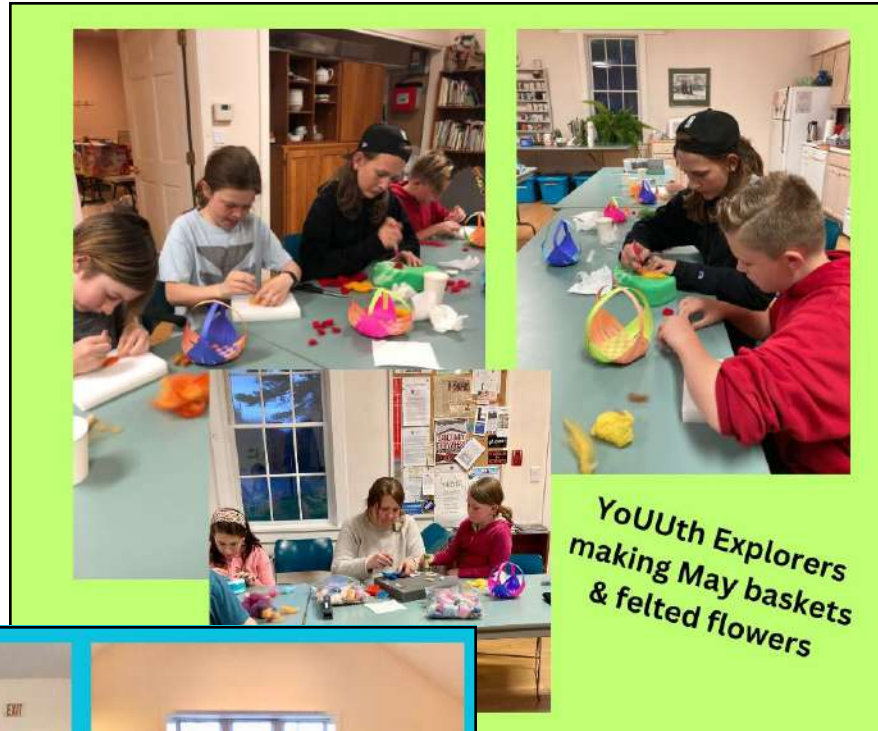
YoUth Explorers making May baskets & felted flowers