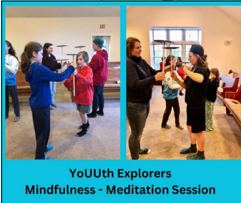
YoUth Explorers Mindfulness - Meditation Session