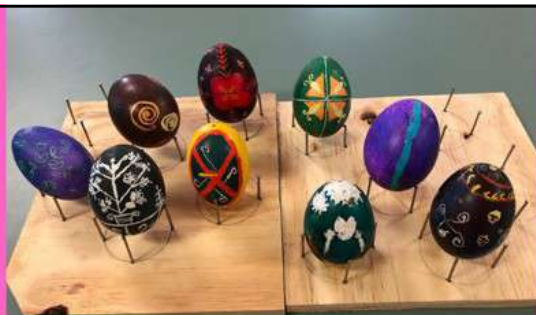
RE Family Gathering Featuring Worship & Ukrainian Egg Decorating