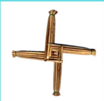
St. Bridget's Cross